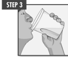
Drink ALL the liquid in the container.