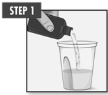
Pour one 6-ounce bottle of Suprep liquid into the mixing container.